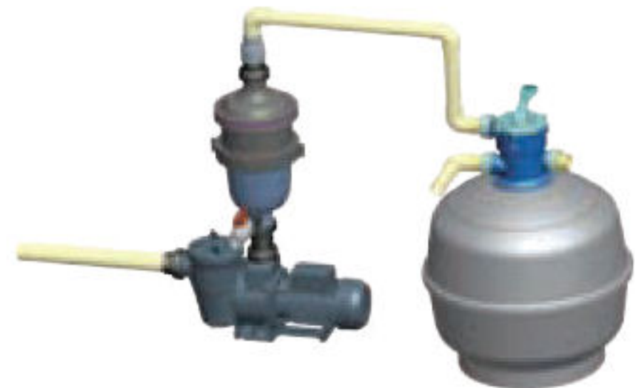
REDUCE FREQUENCY OF BACKWASHING