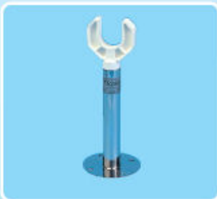
BASE PLATE MOUNTED