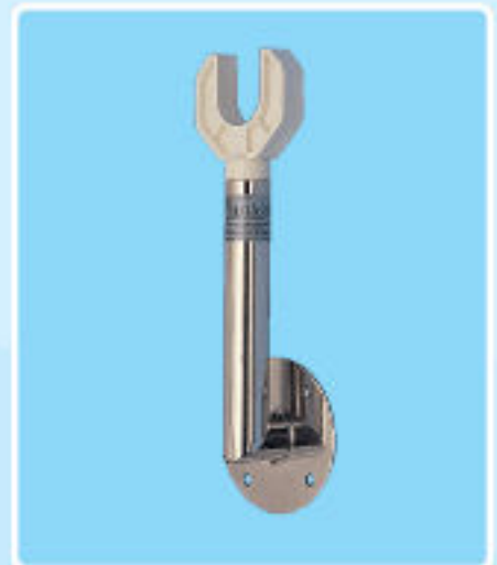
SIDE WALL MOUNTED