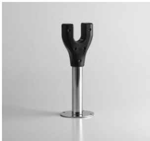
Floor / base mount

The following wall and floor mounts are also available on special request.