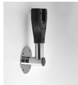
Wall mount (option 2)

For pools less than 11' (3.35m) wide, the internal tubes can be easily reduced by cutting with a sharp hacksaw.