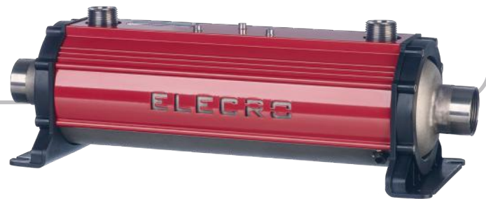
Plate Heat Exchanger

Designed for demanding chemical applications