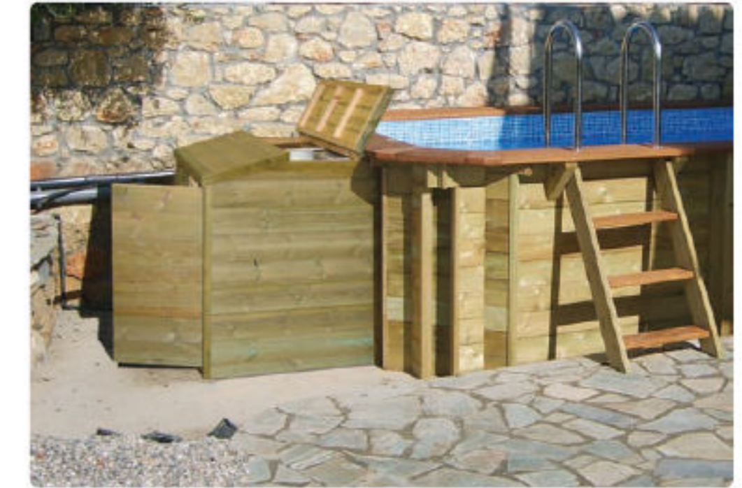
Exercise Pool – 2.4m x 3.9m 1.17m wall height