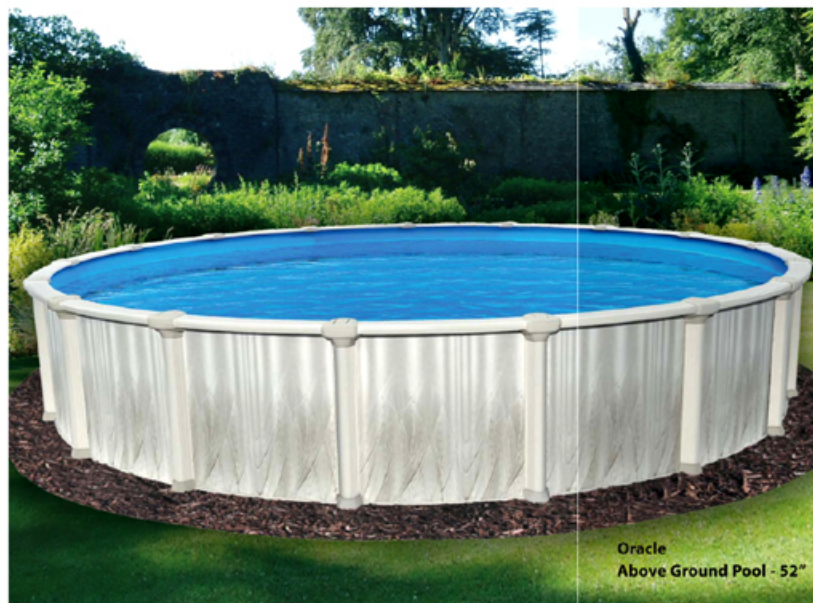
Oracle Above Ground Pool - 52"

Another predominant feature is the Space Saver Oval System which means an oval Oracle is perfect for the smallest of gardens.