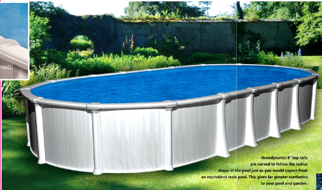
Aerodynamic 8" top rails are curved to follow the radius shape of the pool just as you would expect from an equivalent resin pool. This gives far greater aesthetics to your pool and garden.